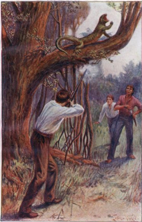
Captain Redwood sent a bullet through the lizard.

powers to either roast or stewed hornbill, and quite equal to the